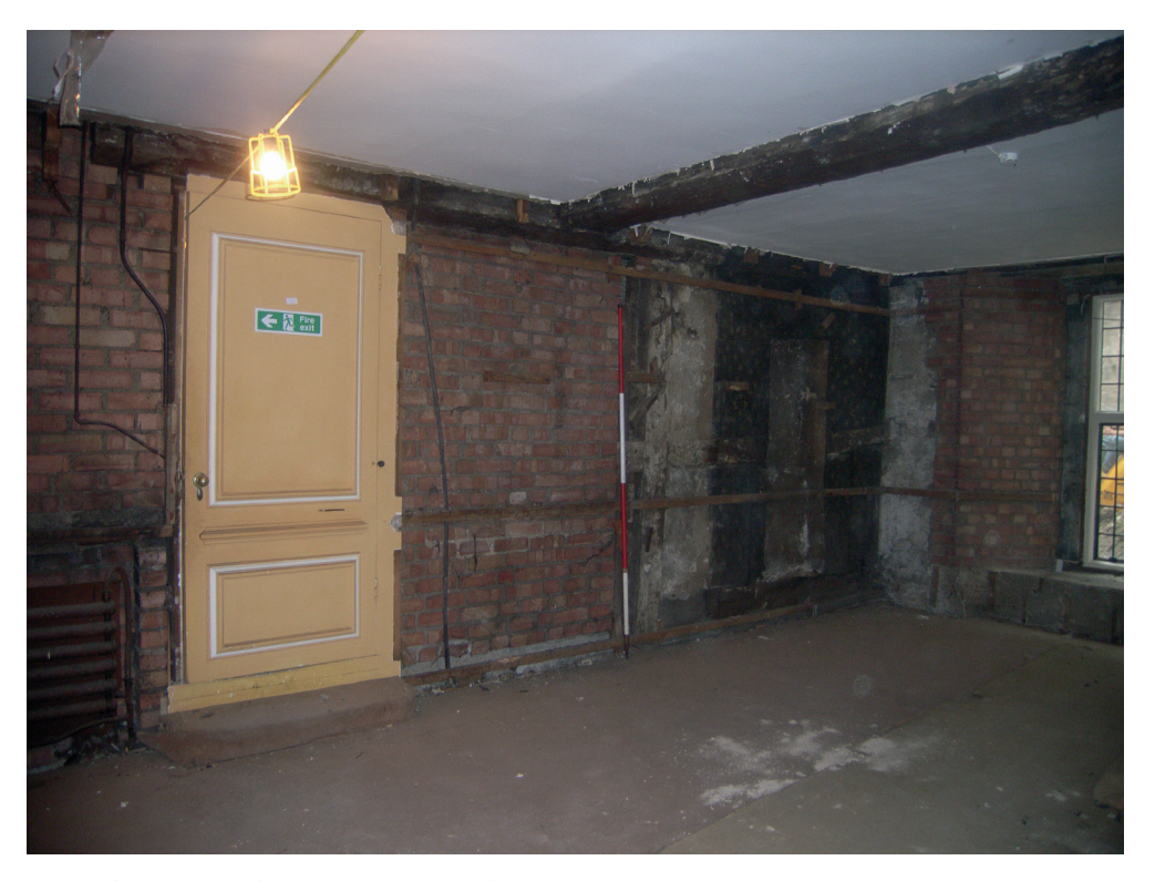
Fig. 2. The east wall of the Eckersley Room after removal of twentieth-century panelling, showing the painted panel in situ.

The decoration extends over the chamfered beam directly above the panelling and also to a beam on the south elevation, suggesting that the decoration was only used in a space c.1.9 by 1.7 metres square. The star decoration is carried over to adjacent panelling, confirming that