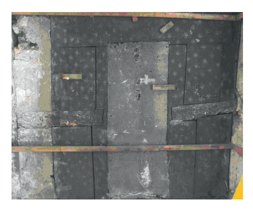
Fig. 3. Detail of the star-painted panel exposed by removal of twentieth-century panelling in the Eckersley Room.

the panels have not been moved from elsewhere. The presence of lath and plaster at differing depths seen beneath the wooden panels suggests that the panelling is not contemporary with the initial build but was added later. The ten wooden boards are c. 25 mm thick and varying in size and shape, having the appearance of wide elm floorboards. They have been cut to fit around the original timber framing. A blocked doorway is set within the panelling, and was either in situ when the panelling was added to the elevation or was cut in afterwards. However, the star pattern is not divided by the doorway, suggesting that the former is more likely. The panelling is nailed to the timber frame behind using hand-made nails. Only one panel can be seen to have rebated edges, but these are not used. The lower sections of panelling are not decorated and were probably later inserted in relation to the change in floor level.